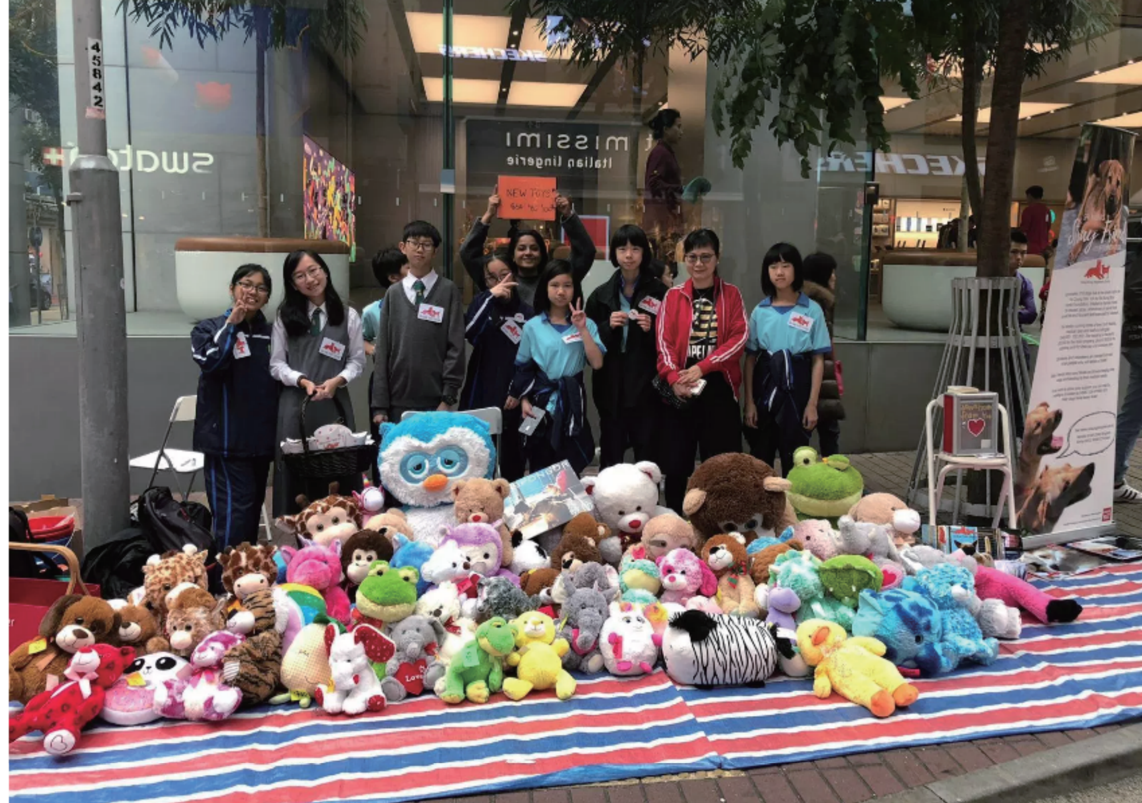
The students from Cheng Chek Chee Secondary

Just before Chinese New Year some Form 1 students from Cheng Chek Chee Secondary School of Sai Kung and Hang Hau District helped Sai Kung Stray Friends Foundation (SKSFF) with a fundraising activity in Causeway Bay.